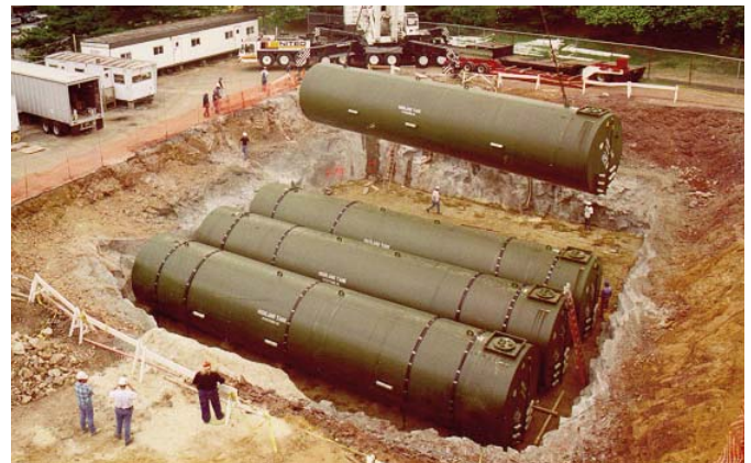
Compatible with a wide range of fuels and chemicals, including biodiesel and ethanol

PROTECT THE ENVIRONMENT. BUY RECYCLABLE STEEL TANKS.