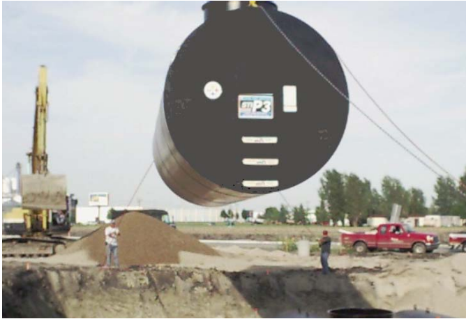
The only UST design which allows on-going monitoring of corrosion protection

sti-P 3 ® double-wall underground storage tank features a pre-engineered corrosion protection system that provides ongoing monitoring of corrosion protection. The sti-P 3 ® system has provided reliable, long-term performance for over a quarter million steel underground storage tanks.