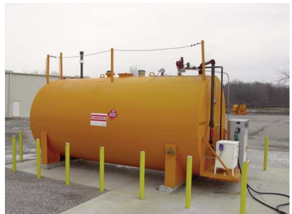
Compatible With a Wide Range of Fuels and Chemicals, Including Biodiesel and Ethanol