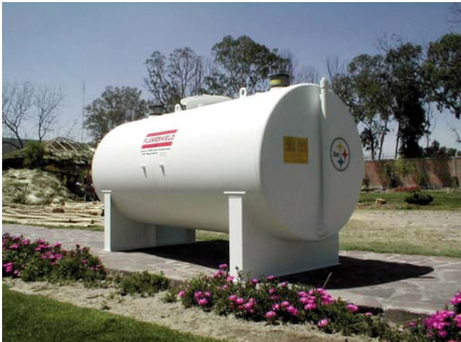
2-Hour 2000° Fire-Tested Performance

FLAMESHIELD® aboveground storage tanks are manufactured with a tight-wrap double-wall design. Standard features include 2-hour fire-tested performance, built-in secondary containment and interstitial monitoring capability.