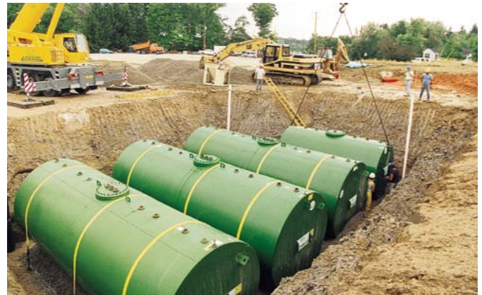
Compatible with a wide range of fuels and chemicals, including biodiesel and ethanol

PROTECT THE ENVIRONMENT. BUY RECYCLABLE STEEL TANKS.