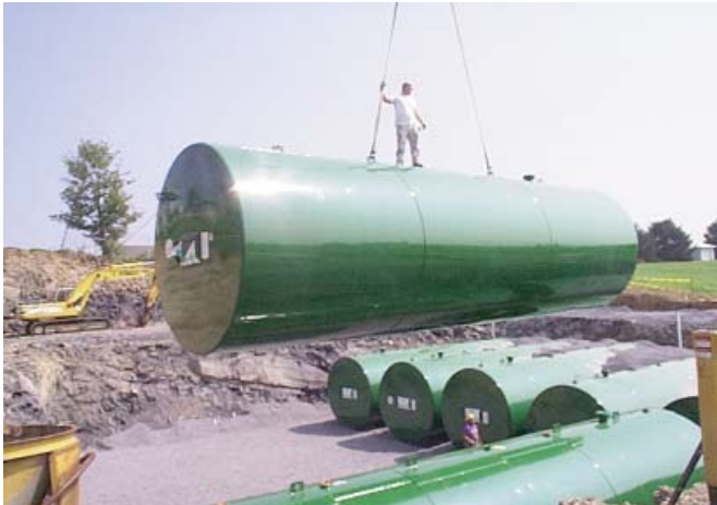
Single or double-wall construction available

ACT-100-U ® tank features a strong inner steel tank for structural integrity, and a thick urethane outer coating for long-lasting corrosion protection. The ACT-100-U ® provides a barrier from corrosion comparable to a fiberglass reinforced plastic coated (composite) steel tank.